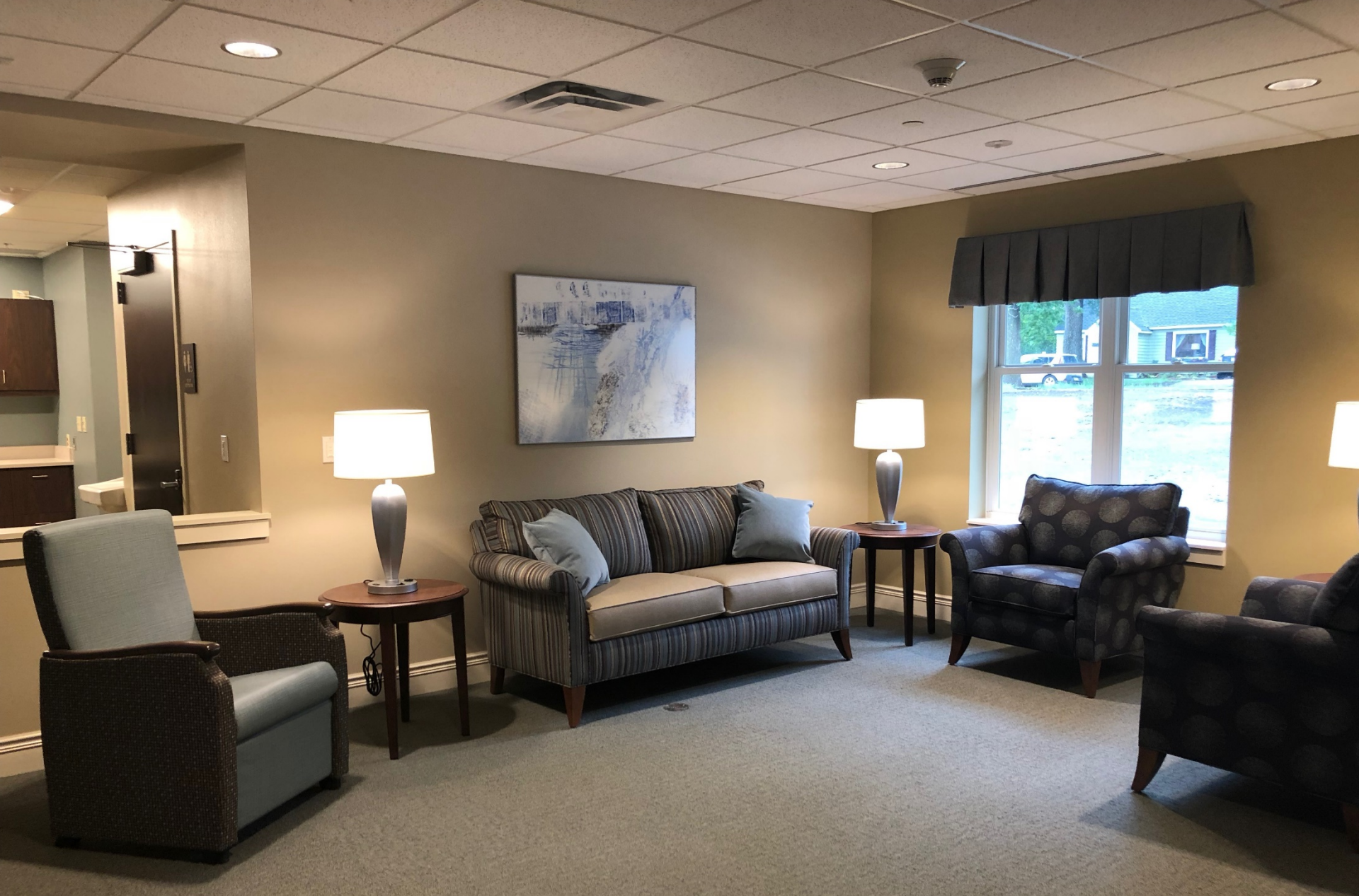
Nurses Station/Sitting Area