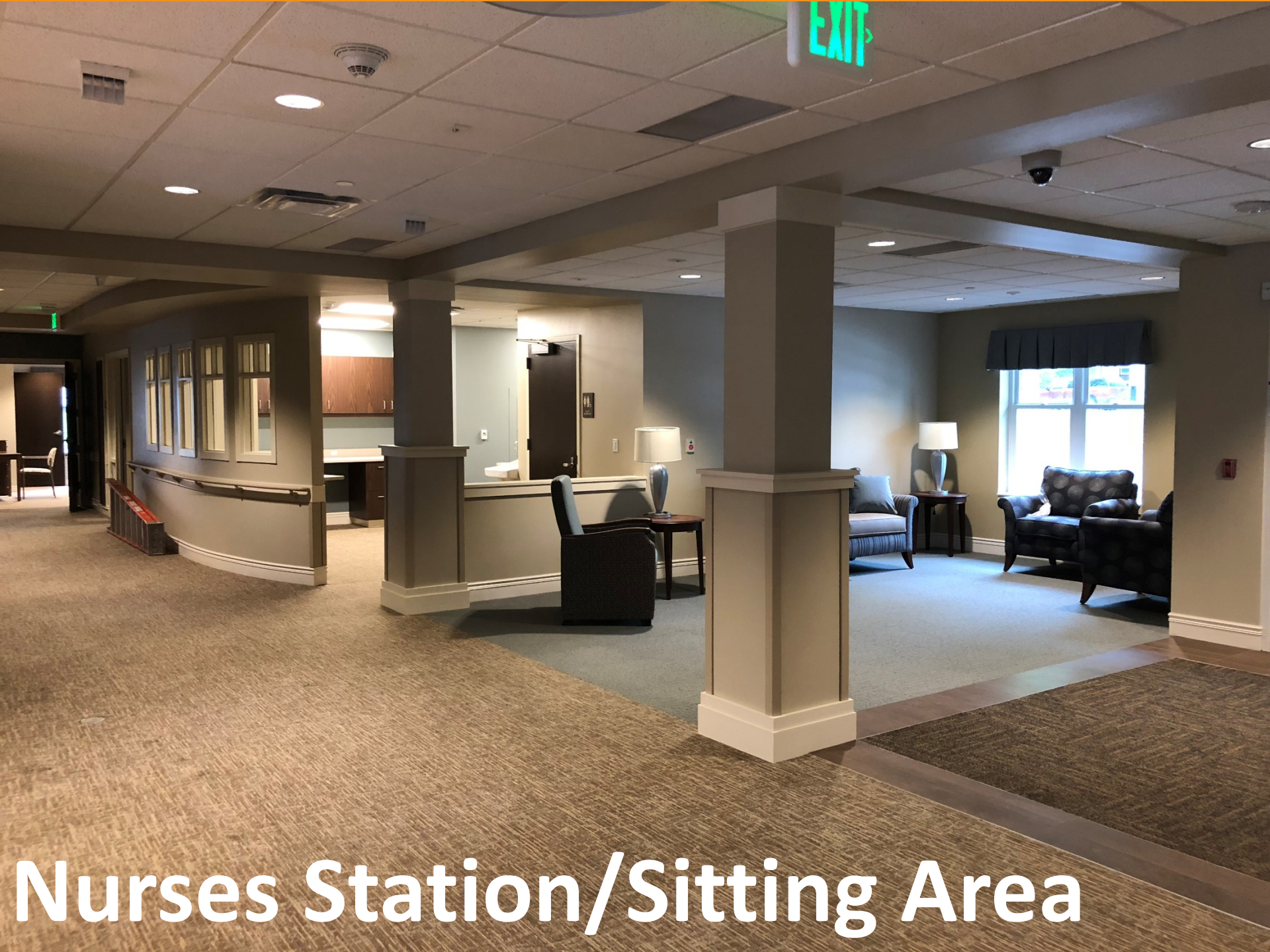
Nurses Station/Sitting Area