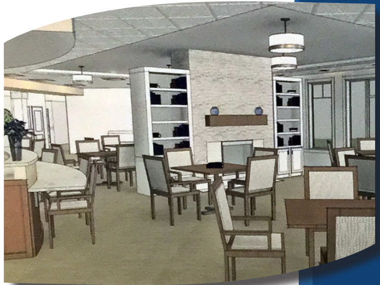
Kitchen and Dining Neighborhood Areas