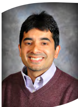
Dr. Ayaz Virji Family Practice