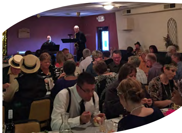
Live Jazz Music was enjoyed throughout the evening.