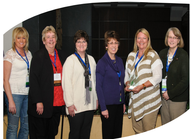
JMHS Staff receiving statewide recognition for the Restorative Care Program

The Lac qui Parle Health Network (LqPHN) partnership has proven to be beneficial to each of the three independent healthcare facilities. You will hear us refer to the Lac qui Parle Health Network more frequently since healthcare collaborations has become more important in recent years.