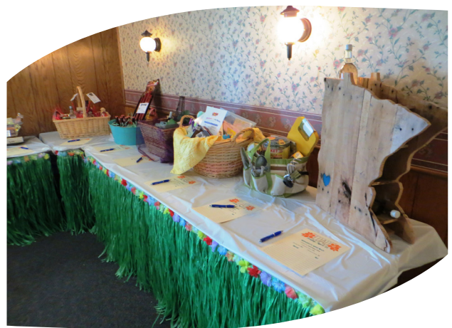
Some of the great baskets available to bid on during the Silent Auction at the Gala.