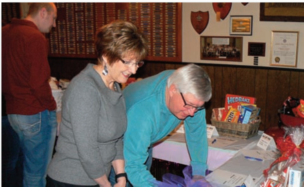
Bidding on Baskets at the 2013 Gala

Thank you for making a difference in the lives of our residents and patients!